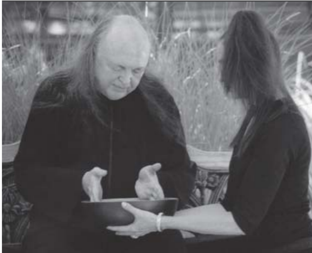
Avatar Adi Da blessing almonds for His devotees to receive as Prasad, 2005

This feeling-sense of separation is what Adi Da calls the "I", the ego, or the "self-contraction". He Teaches that the self-contraction is something we are doing, not something that is happening to us. Adi Da appeared in human form for a time to "learn" this limitation, and to fully Reveal the means to transcend self-contraction in the Prior Divine Reality that is His Eternal State.