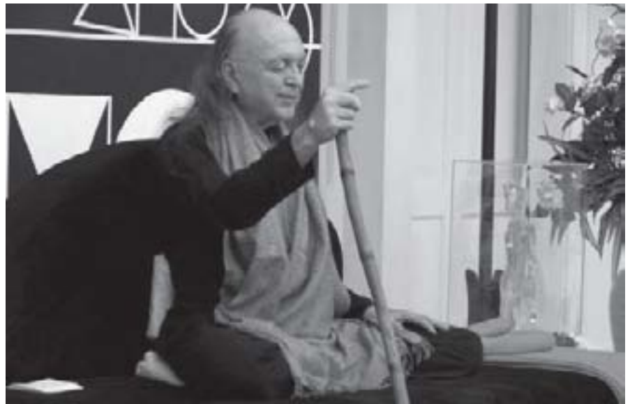
Avatar Adi Da sitting with devotees, June, 2008