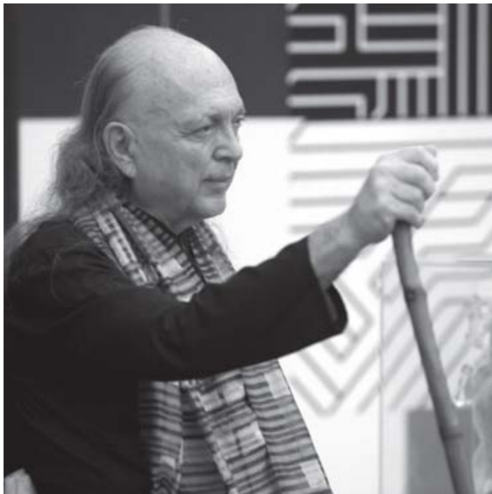
Avatar Adi Da, 2008

Only the Divine Heart Itself Is the Radiant Continuum of Satisfaction, the Unobstructed Flow of Divine Spirit-Power. Only the Divine Heart Itself Always Already Knows Perfect Satisfaction, Perfect Desirelessness—because the Flow of the Divine Heart-Current is Always Already Accomplished. Always Already Accomplished—not accomplished as the result of any motivated action.