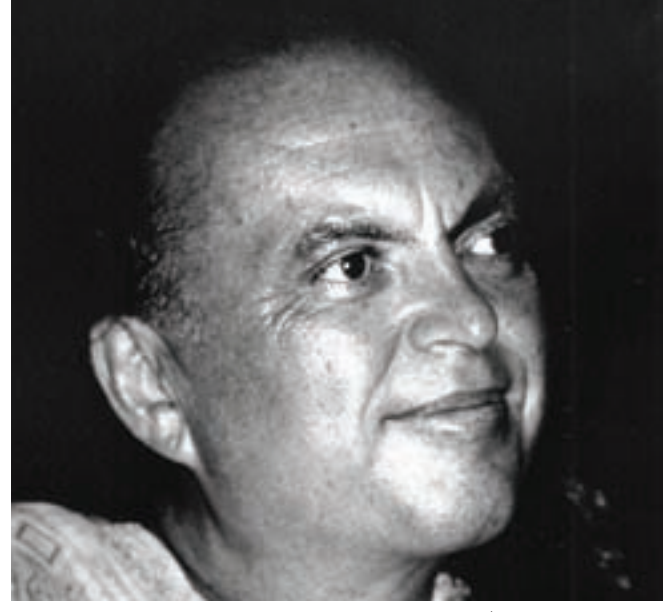
Avatar Adi Da Samraj, 1987